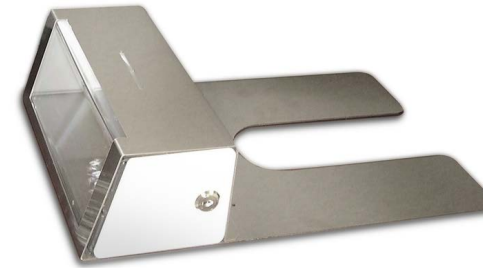
CounterCop Long Frame