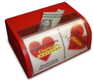
SNAP-TITE Universal Canister