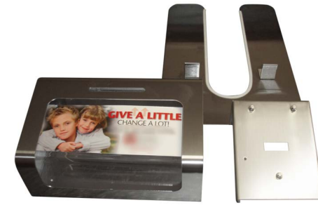
CounterCop IIIC Canister Set

Stainless steel frame and polycarbonate canister with rounded, low-profile design. Counter plate features mounting pedestal to receive electronic credit card processing terminal. Secures with optional 26" security cable (additional charge).