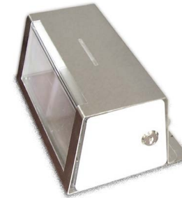
CounterCop II Short Frame